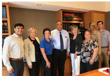
SpringBoard members lead board training